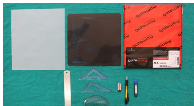
Figure 1: Armamentarium