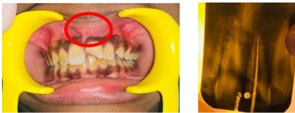
Figure 1: Ellis class II fracture with 21 and previous IOPA of the same

A 10 years-old male patient presented to the Department of Oral Medicine and Radiology, with the chief complaint of pain and swelling in the upper front region of the jaw for 2-3 days. The patient recalled a history of trauma in the offending tooth 3 years back. Although the tooth was asymptomatic, it started to develop blackish discoloration. Endodontic treatment was done 20 days back; however, he failed to rehabilitate the tooth. Again, the patient experienced pain and swelling in the same region for 2-3 days, the swelling has gradually increased to present size gradually increasing to the present size. The pain was dull aching and continuous in nature. His past dental history revealed a visit to a private dental clinic where RCO was done and temporary dressing with tooth 21 was given 15 days back. Patient brought with him the previous intraoral periapical radiograph with 21. His past medical history was non-contributory (Figure 1)