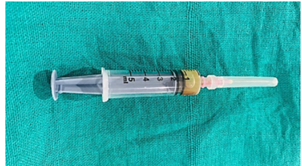
Figure 3: FNAC yielding turbid brown-colored fluid.

Intraoral examination revealed localized gingival swelling seen associated with 21,22, Ellis class II fracture 21. Tenderness was +ve with 21 on vertical percussion, Temporary dressing is seen with 21. A provisional diagnosis of Infected radicular cyst w.r.t 21,22 was given. FNAC (Figure 3), pulp vitality, and CBCT (Figure 4) were advised.