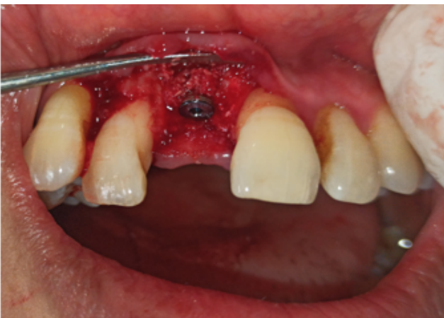
Figure 3: Bone graft placement.