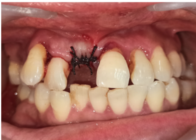
Figure 4: Sutures placed