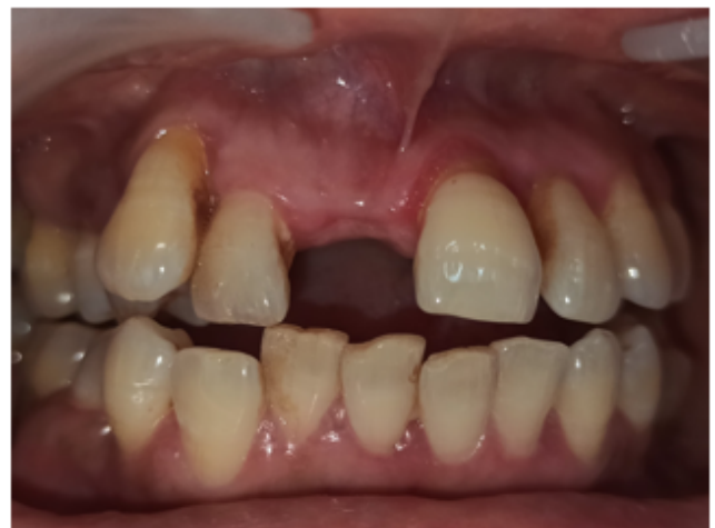
Figure 1: Pre-operative

After final drill, parallel pin was placed. After examining the position of parallel pin, Norris implant of dimension 3.75 / 8 was placed in the apicocoronally depth of bone 12 mm. Periapical radiographs were taken prior to implant placement; they did reveal pathology but not of much depth. During implant placement we came to know that buccal cortical plate defect.