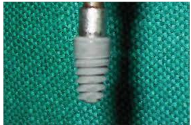
Figure 6: Exfoliated implant