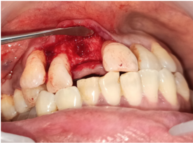
Figure 2: Drilling done