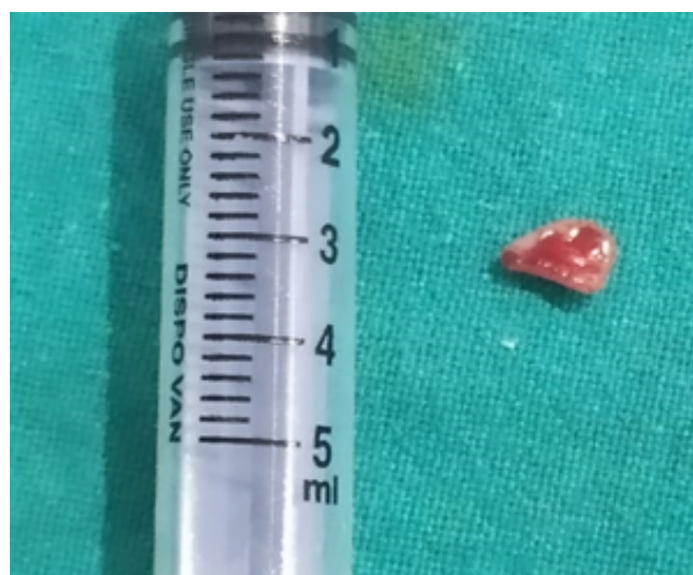
Fig. 3: Tissue excised and was sent for