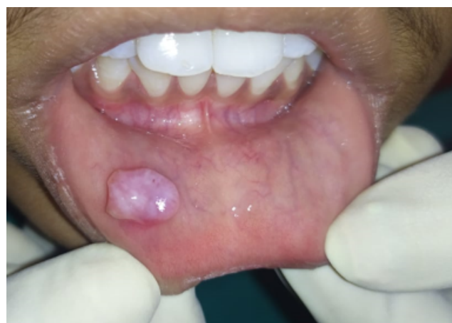
Fig. 1: Pre-operative picture of lesion

began modest and progressively increased to its current proportions. There was no substantial medical history to speak about. A spherical, single, fluctuant swelling was noticed on the inner side of the lower lip near the left lateral incisor area during an intraoral examination. Swelling was 4-5 mm below the lower lip's vermillion border, measuring roughly 4 mm 3 mm 2.5 mm. The swelling was whitish red in colour. On examination of the lesion, it was soft in consistency, fluctuant, and palpable with no increase in temperature and oval in shape. No other oral anomalies were detected. Patient gives history of trauma while eating 1 month back. Also, patient gives history of increase in size while mastication and decrease in size after some time. Thus, the provisional diagnosis of Mucoccele was given. Figure 1